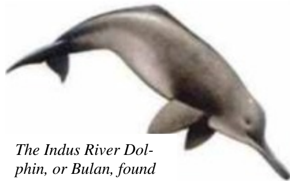
The Indus River Dolphin, or Bulan, found only in Sindh, is on the verge of extinction.

Pakistan is proposing to build another mega-dam called the Kalabagh Dam and a canal called Thal—these projects would further block and divert huge amounts of water upstream. The Indus is one of the largest carriers of silt—replenishing Sindh’s agricultural soil in what is otherwise an arid desert. The amount of silt carried by the Indus has already been reduced from an average of about 1,000,000 tons a day before 1955 to 400,000 tons; the proposed Kalabagh Dam will further rob Sindh of half of this vital soil.