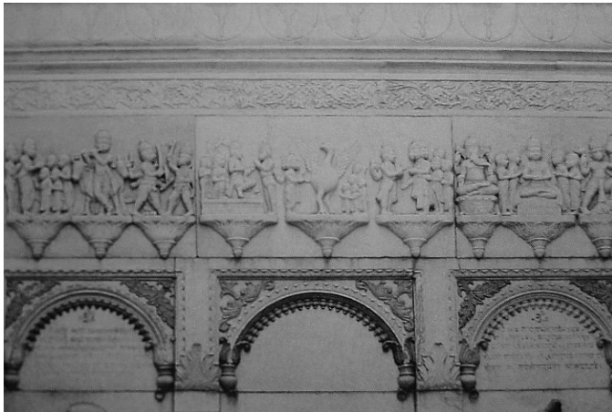
Carving at Saadha Belo Island Temple, Sindh—one of holiest Hindu Sindhi shrines. The shrine was vandalized by the Pakistani army in 1965.

the pain of exile, and Sindhi writers in Sindh lament the loss of diversity in Sindhi society.