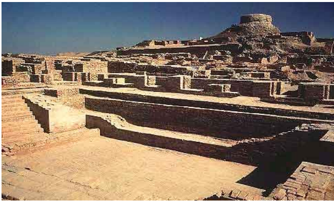
Moenjodaro: View from ritual bathing pool

Sindh is an ancient country whose civilization stretches back to the earliest human settlements. The ancient Sindhi people embraced a peaceful way of life. Moenjodaro, a city that flourished in 2600 B.C., showed advanced city planning and well-developed arts, yet an absence of even basic military fortifications and weapons.