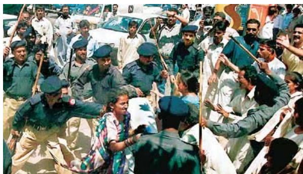
Pakistani police clubbing peaceful demonstrators

Sindhis are suffering from a military dictatorship bent on using their resources to promote a militant Islamist agenda—for example, by developing nuclear weapons and exporting them to other Muslim countries, and by facilitating the training of terrorists in madrasahs. The repressive nature of the Pakistani regime, and its powerful ethnic base in a fanatic fundamentalist population, make it nearly impossible for Sindhis to engage in a civic dialog within Pakistan.