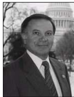
Congressman Tom Tancredo

“The treatment received by the Sindh province in Pakistan is also of concern. Sindhis are peace loving, nonviolent Sufis, supportive of the American values of democracy and secularism, and opposed to terrorism and nuclear arms. However, they continue to be marginalized by the Pakistan Government, and are negatively affected by the Pakistani Government's efforts to dam the Indus River.”