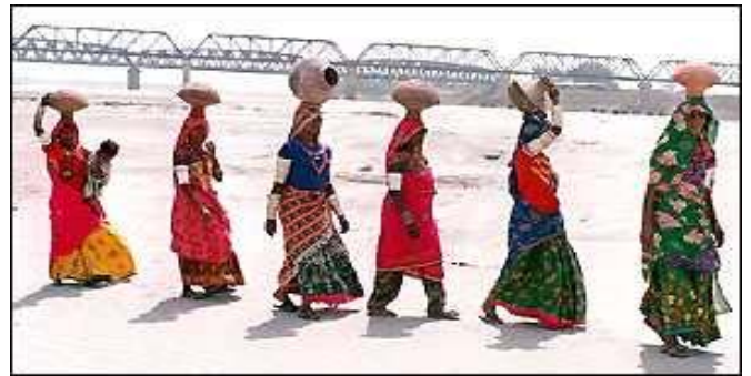
Searching for water in the riverbed of the once mighty Indus.

Water no longer flows to the sea; as a consequence, the mangrove forests have experienced a 90% decline—from 2400 square kilometers to 200 square kilometers. Without protection from the mangrove forests, seawater has encroached—inundating 1.2 million acres of agricultural land and uprooting residents of 159 villages. The once plentiful seafood catch has been drastically reduced. The net result is that throughout Sindh, poverty levels, malnutrition and disease now match those in Sub-Saharan Africa.