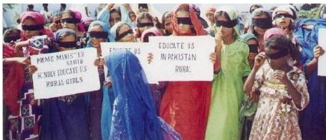
Primary school girls in Sindh village wear blindfolds as a protest against lack of secondary schools. A placard reads, "Educate Us Pakistan."

A majority of Sindhi girls and almost half of Sindhi boys do not receive even basic schooling and remain illiterate. Yet Pakistan continues to allocate a majority of its available budgetary resources to its military. Pakistan's 2003-04 federal budget allocated Rs 3.1 billion (about US $52 million) for education while allocating Rs 161 billion (about US $2.7 billion) for the military. The actual military expenditure is substantially higher—for example, the pensions of retired military personnel are not included in the military's budget. The 2004-05 provincial budget of Sindh, also dictated by the federal government, allocated Rs 2.6 billion ($43 million) for education while allocating Rs 10.1 billion ($168 million) for 'law and order.'