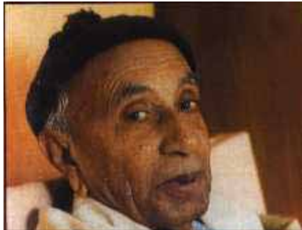
Saeen G M Syed – 1904-1995

Last year, WSC established the Saeen G. M. Syed Memorial Award, “to honor the memory of Mr. Syed.” Saeen G. M. Syed, was a visionary leader who pioneered the Sindhi freedom movement and was a beacon of the Sindhi people’s struggle for national self-determination. Mr. Ram Jethmalani, the Chief Guest of the event